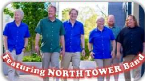
Featuring NORTH TOWER BAND