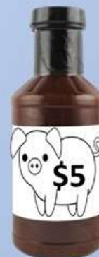
Hursey's Barbeque Sauce